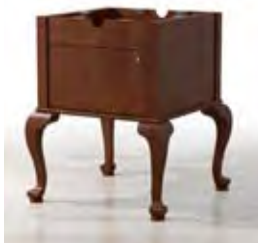
Queen Anne Cube