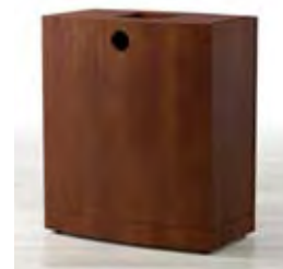
Elliptical Half Cube