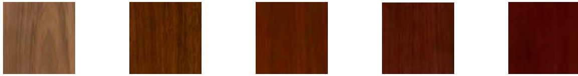
Light Walnut Natural Walnut Judicial Walnut Executive Walnut Senate Walnut