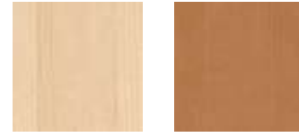
Clear Maple Wheat Maple