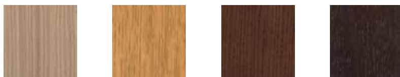
Blush Oak Wheat Oak Toast Oak Mocha Oak