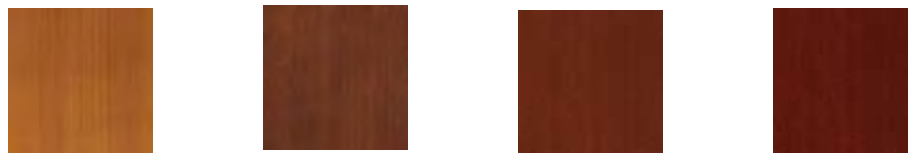
Clear Mahogany Natural Mahogany Scotch Mahogany Medium Mahogany