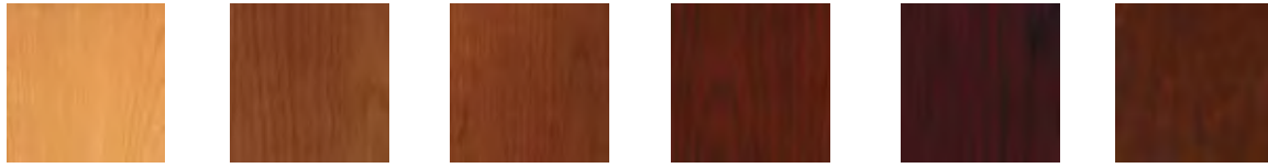
Clear Cherry Natural Cherry Scotch Cherry Medium Cherry Dark Cherry Koko Cherry