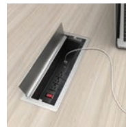
Flip Top Worksurface Access Box