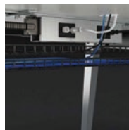
Under Surface Power