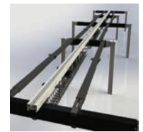
Structural Spine Beam