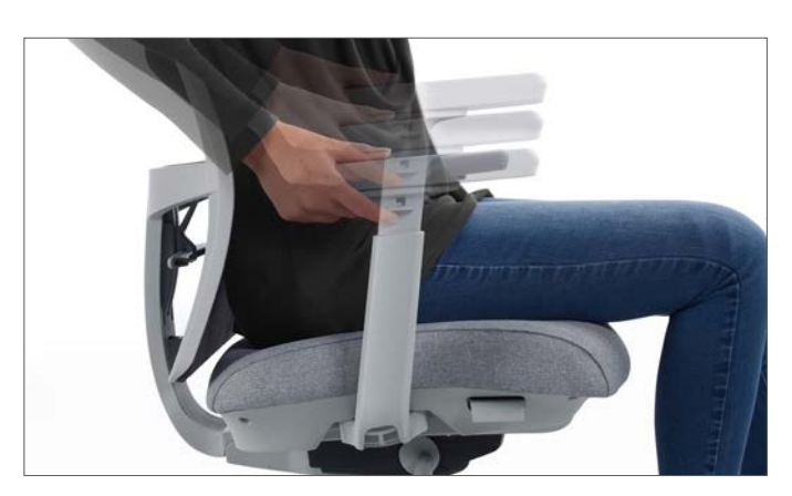
Height adjustment (arm height)